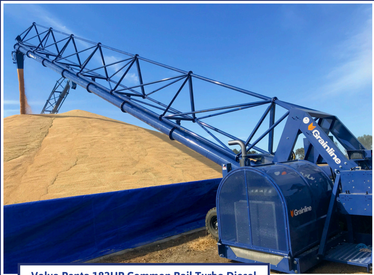
Volvo Penta 182HP Common Rail Turbo Diesel