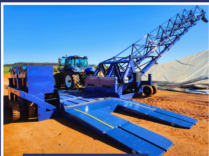
Low Profile Hopper