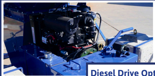
Diesel Drive Option

Perfect for emptying grain bunkers. Powered by a water-cooled Yanmar diesel engine or PTO tractor. Features a high-capacity 15" outloading auger with an 8m barrel. Optional directional spout offers precise grain flow control, improving the filling process. Outloading capacity: up to 340 tonnes/hr (wheat).