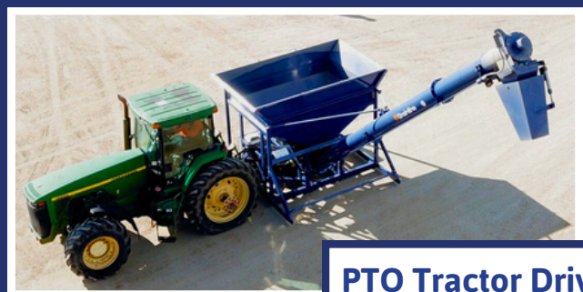
PTO Tractor Driven