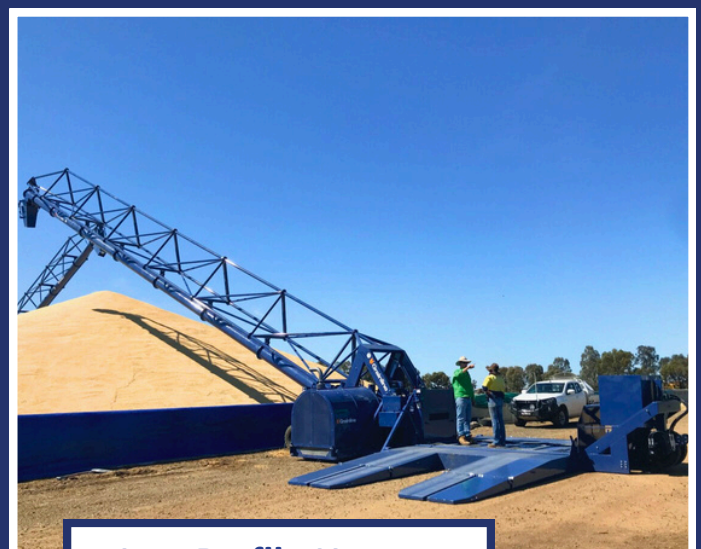
Low Profile Hopper